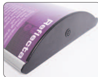
'D' shaped profile