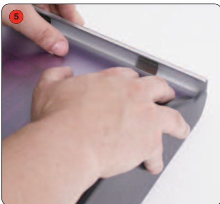
Close the snap frame sides to secure the graphic into place.