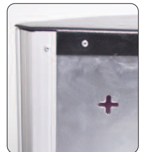
Screw ports for wall mounting